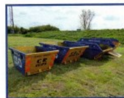
Mini (2 Yard)