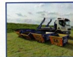
Builders (8 Yard)