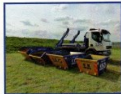
Builders (8 Yard)