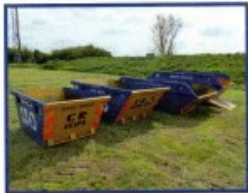
Mini (2 Yard)